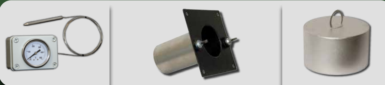
GAS FILLED DIAL THERMOMETER WITH 100 CM. STEEL BULB