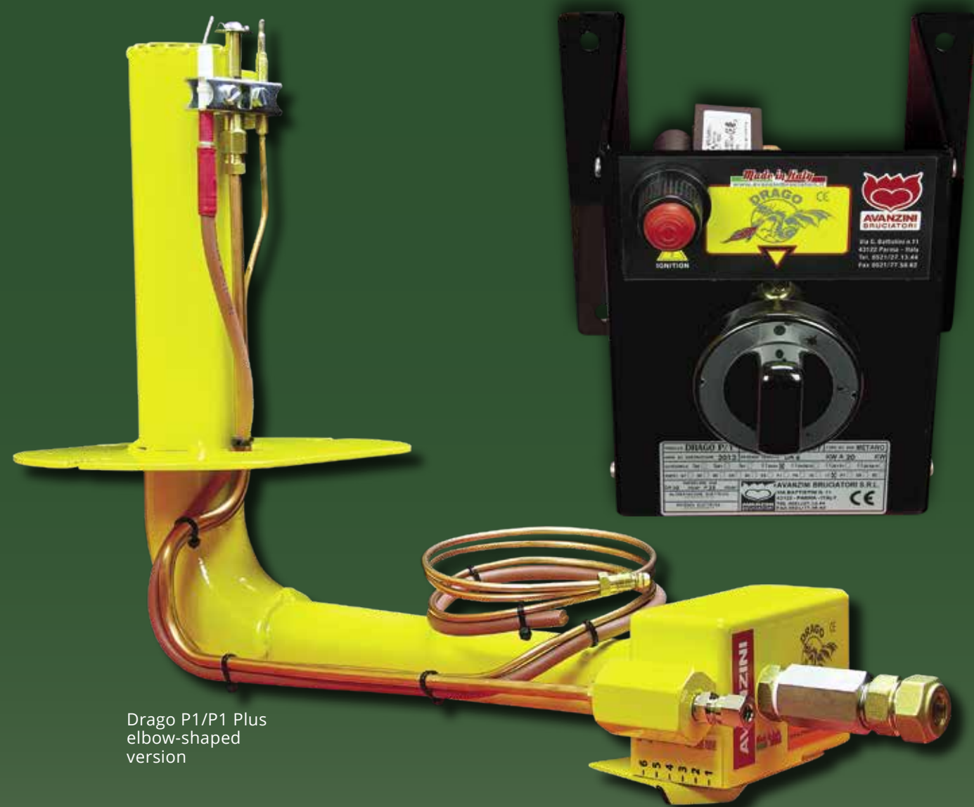
Drago P1/P1 Plus elbow-shaped version