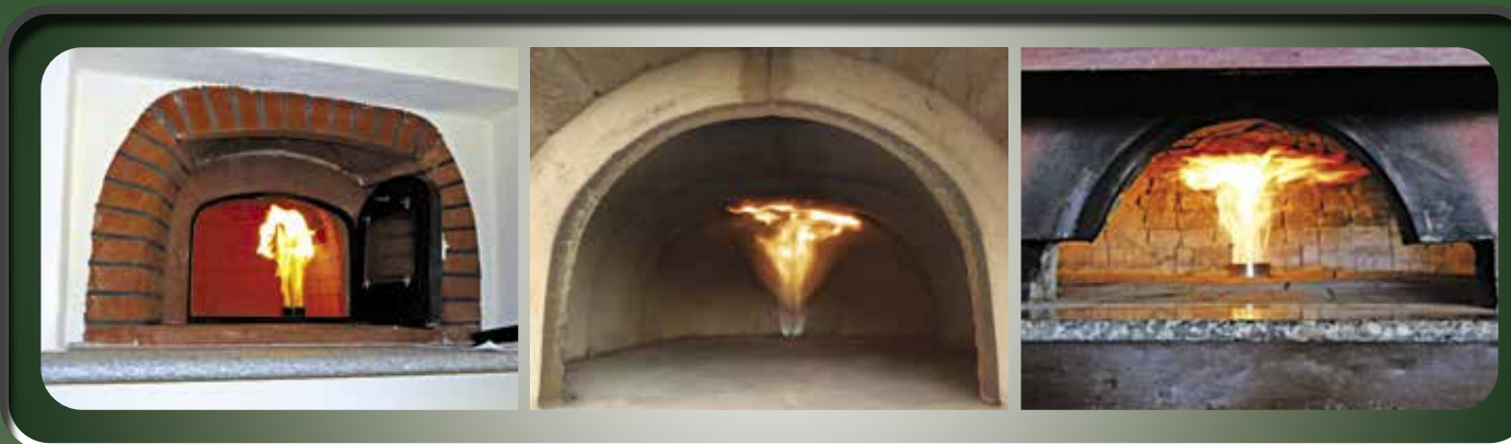
STEEL BURNER CAP CLOSURE