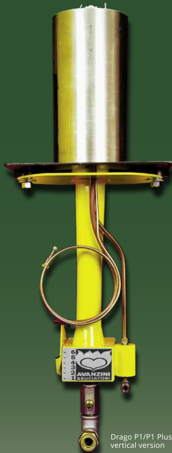
Drago P1/P1 Plus vertical version